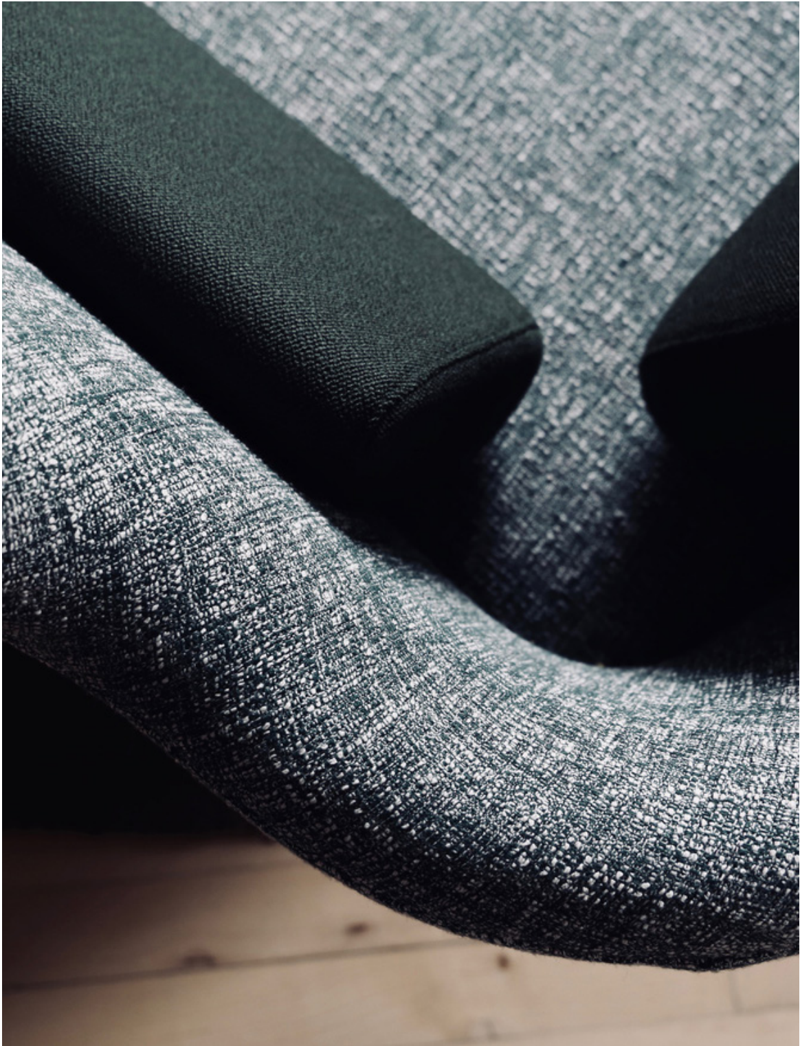
57 SOFA 1957 BY FINN JUHL